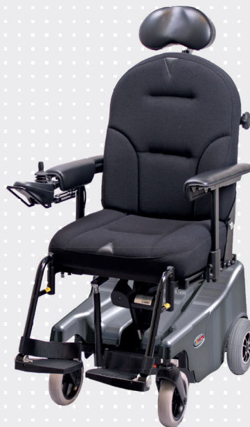
Blues 100 with Comfort I seat and back

VELA Blues 100 comes with front-wheel drive or rear-wheel drive to meet the requirements of the user.