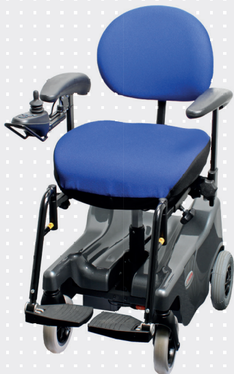
Blues 100 with rear-wheel drive

VARIANT: Front-wheel drive :: Rear-wheel drive